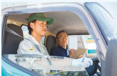
Guidance from a safety expert