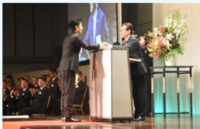
Commendation awards for zero traffic accidents